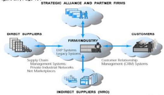
Figure 2.7, Page 104